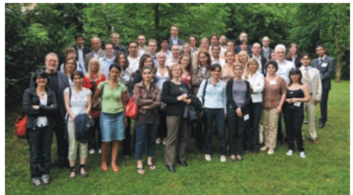
Faculty and student participants of the MDS-ES Summer School in Marburg.